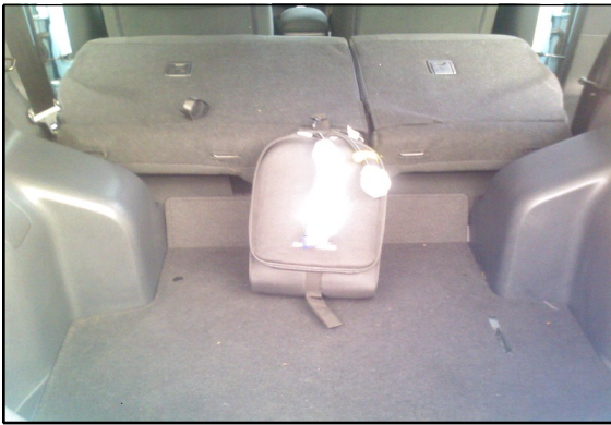
3kw CHARGE CABLE

Comments: FULL ELECTRIC VEHICLE, 3.3 kw model