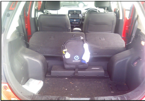
3kw cHARGE CABLE