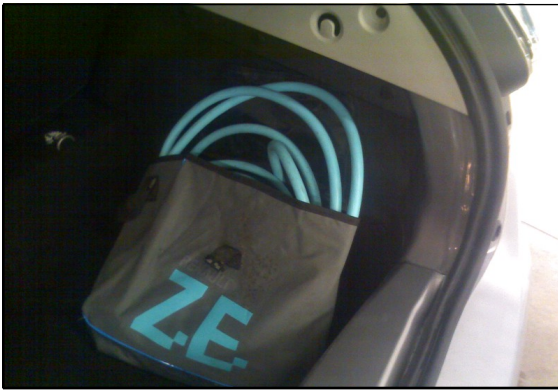
ZOE CHARGE CABLE