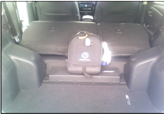
3 kw Charge cable

Comments: FULL ELECTRIC VEHICLE 3.3 kw model