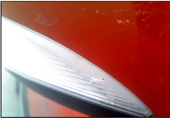
osf wing mirror

Comments: previous repairs visible, boot divider missing,