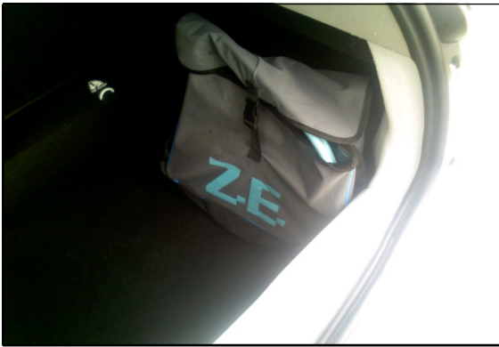
ZOE CHARGE CABLE