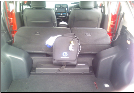
3 KW Charge CABLE

Comments: FULL ELECTRIC VEHICLE 3.3 kw model