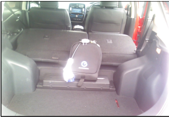
3 kw charge cable

Comments: FULL ELECTRIC VEHICLE 3.3 kw model