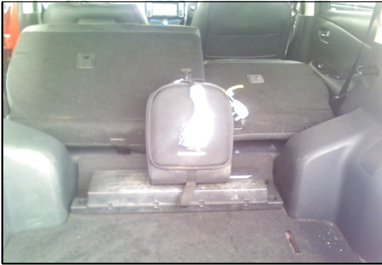
3 kw charge cable