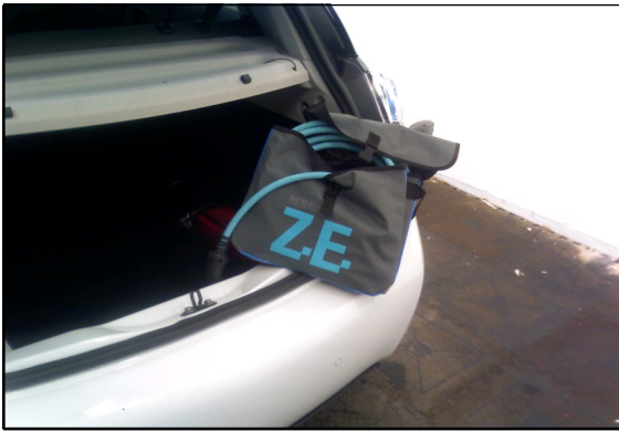
Zoe charge CABLE

Comments: FULL ELECTRIC VEHICLE SUBJECT TO A BATTERY HIRE AGREEMENT