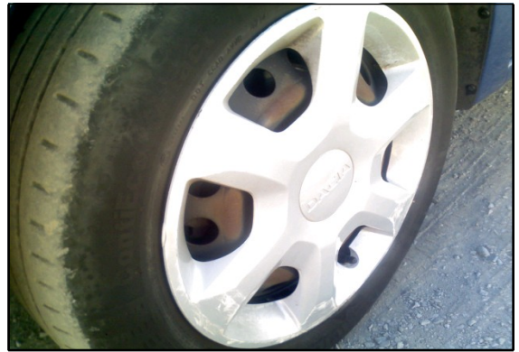
nsf wheel trims

Comments: wheel trims badly marked all round.