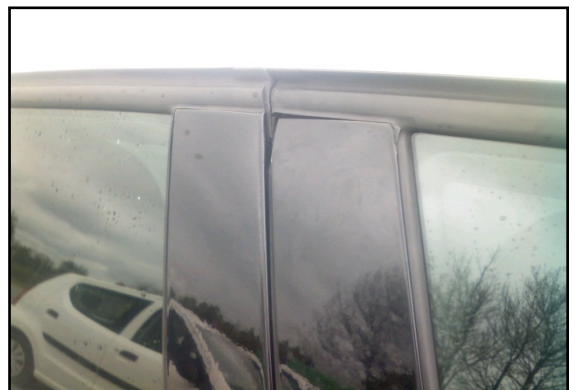
nsf door moulding