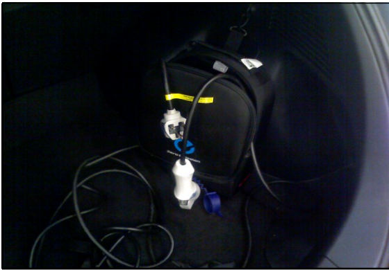
3kw charge cable