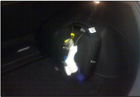
3kw charge cable

Comments: FULL ELECTRIC VEHICLE 3.3kw Model