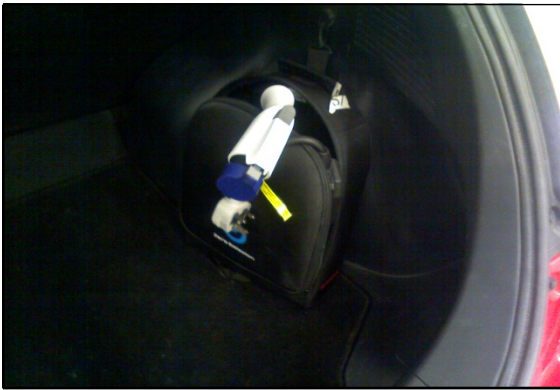
3kw charge cable

Comments: FULL ELECTRIC VEHICLE 3.3 kw MODEL