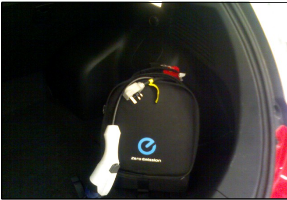
3kw charge cable

Comments: FULL ELECTRIC VEHICLE 3.3kw model