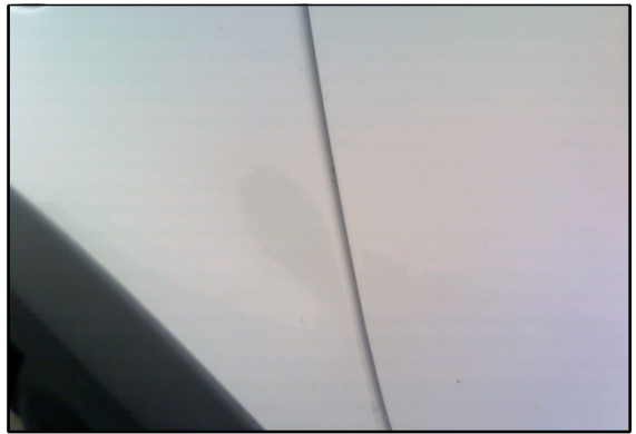
osr qtr panel