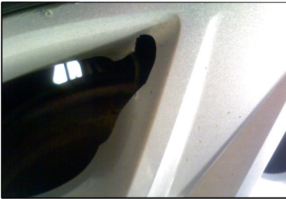
nsr wheel trim